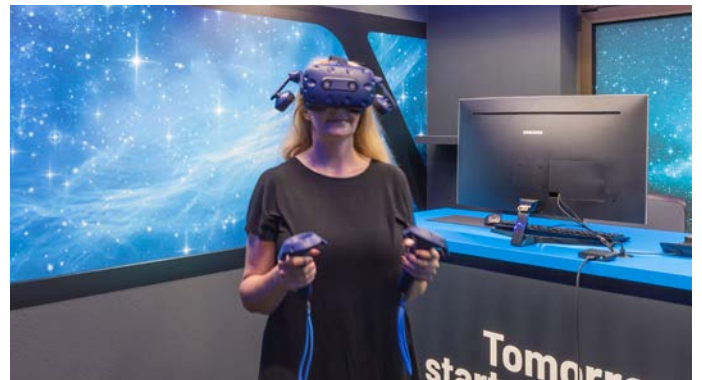
Experience the analysis of your 3D LaserScan with VR glasses.

The 3D LaserScan-analysis sets new standards for the wear analysis, project planning and during any other phase of your repair.