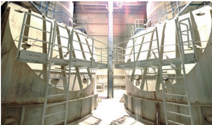
Photo of the plant